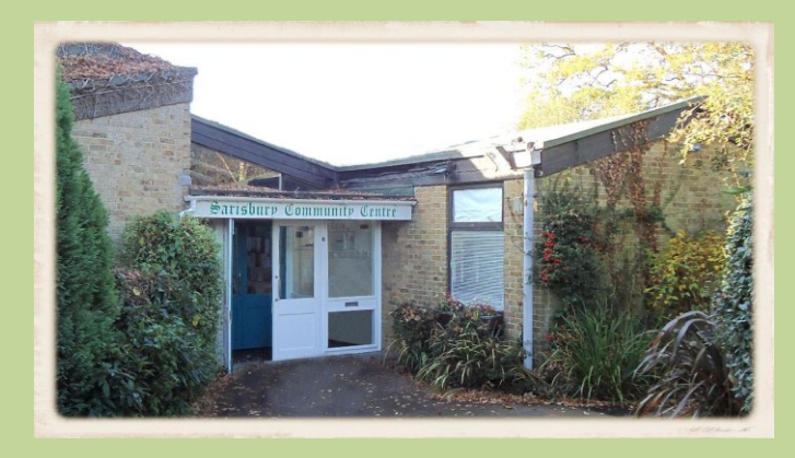
The Centre On The Green